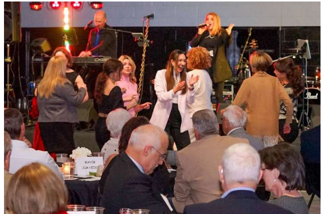
2025 Dinner Theater fun