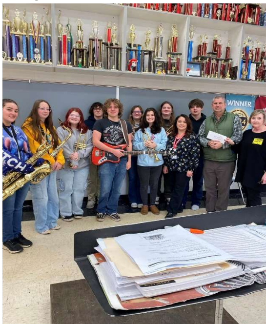
One of our 2025 grant awards B. B. Comer Band