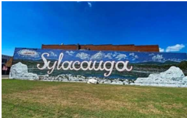
Contributed to the beautiful mural