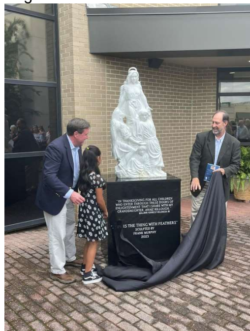
Dedication of sculpture "Hope is the thing with Feathers"