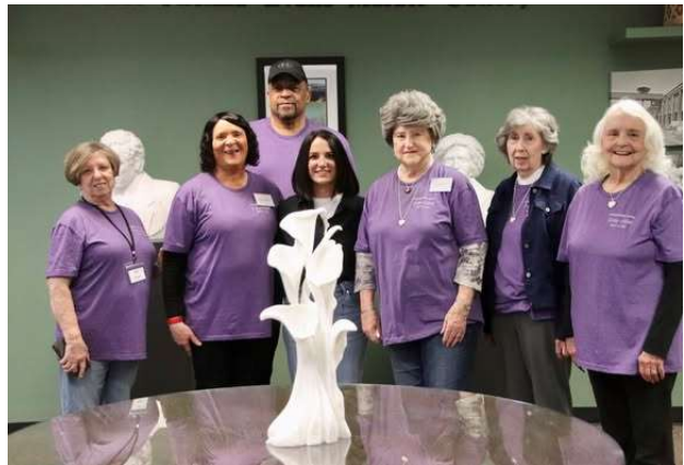
Magic of Marble Festival sales room